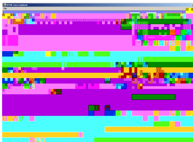
Figure 5. SENSE user interface for reviewing, annotating and sharing data