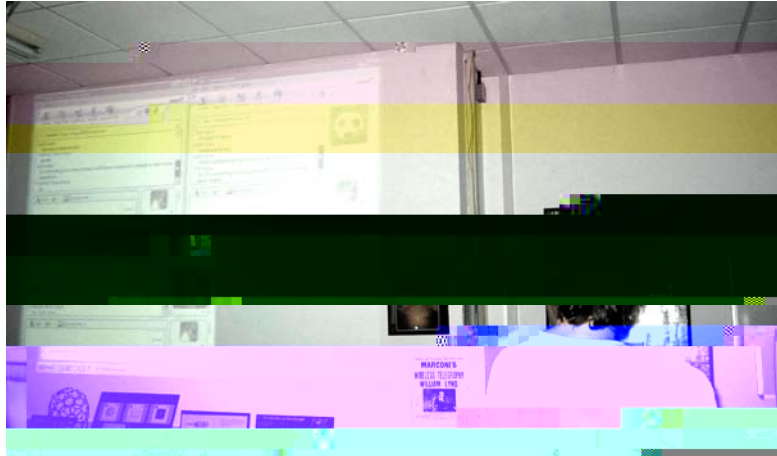
Figure 2. Researcher types messages from the class to three remote scientists.